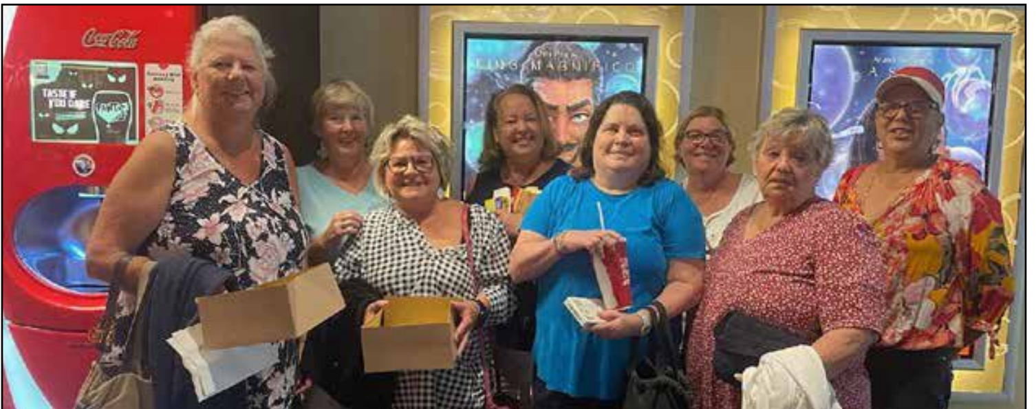
At the Movies