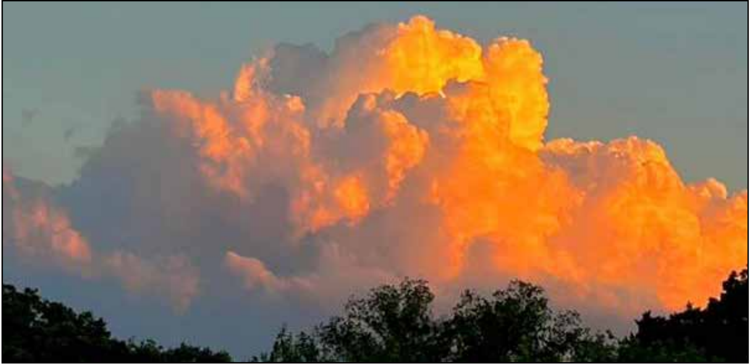
Sunset at Lake Griffin