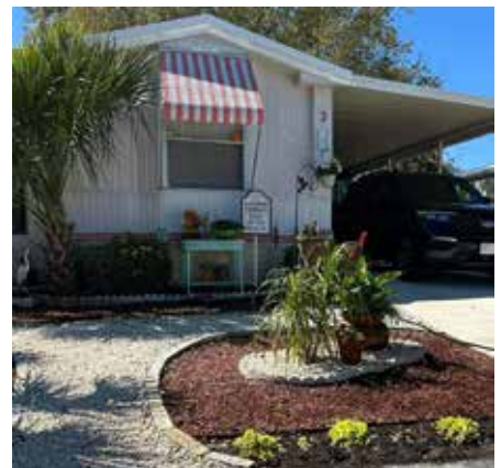
3 Lake Griffin