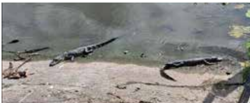
Gatorland might as well be around home.