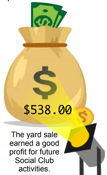
The yard sale earned a good profit for future Social Club activities.