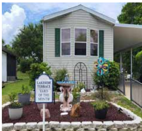
11 Lake Griffin