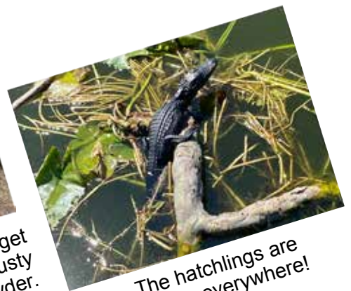
The hatchlings are everywhere!