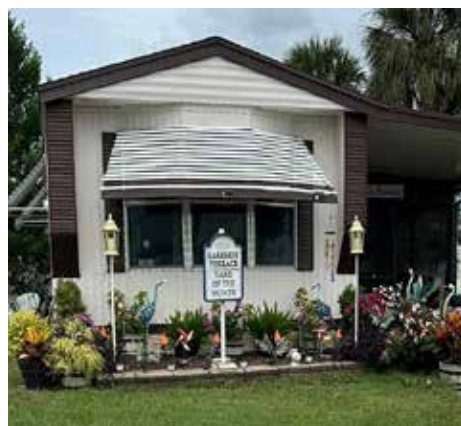
39 Lake Griffin