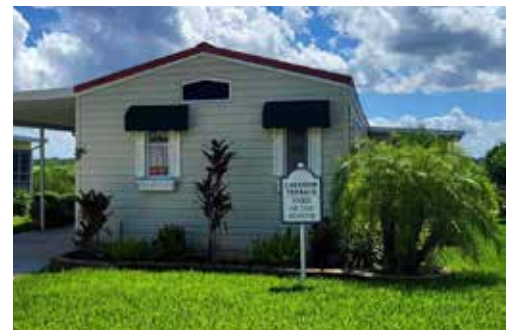
89 Lake Griffin

To nominate your neighbor, call the office.