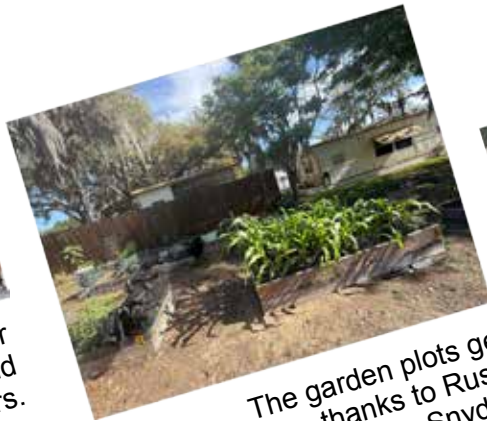
The garden plots get numbers, thanks to Rusty Snyder.