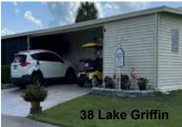
38 Lake Griffin