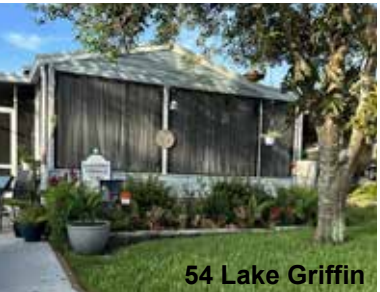
54 Lake Griffin