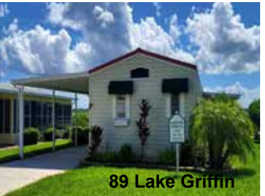
89 Lake Griffin