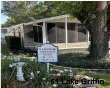
61 Lake Griffin