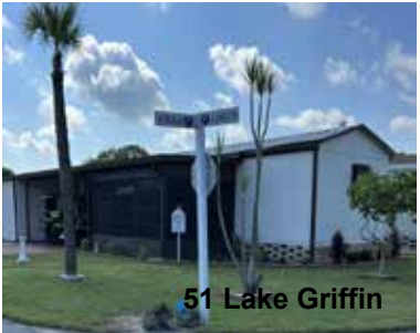
51 Lake Griffin