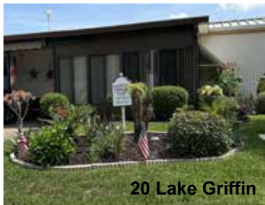
20 Lake Griffin