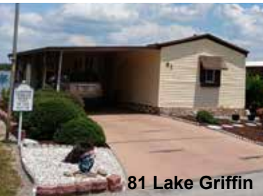
81 Lake Griffin