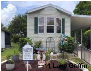
11 Lake Griffin