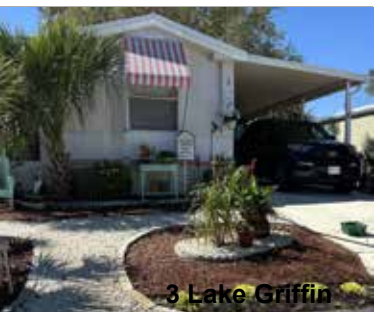
3 Lake Griffin