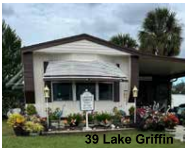
39 Lake Griffin