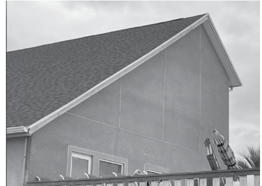
Almost nothing escaped January's cold

clockwise below- avocado tree, Norfolk Island pine, ponytail palms, roebellini palms, cactus.