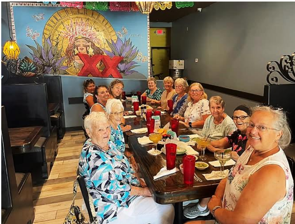
May's Ladies' Luncheon at Luna Azul Authentic Mexican Restaurant, Leesburg