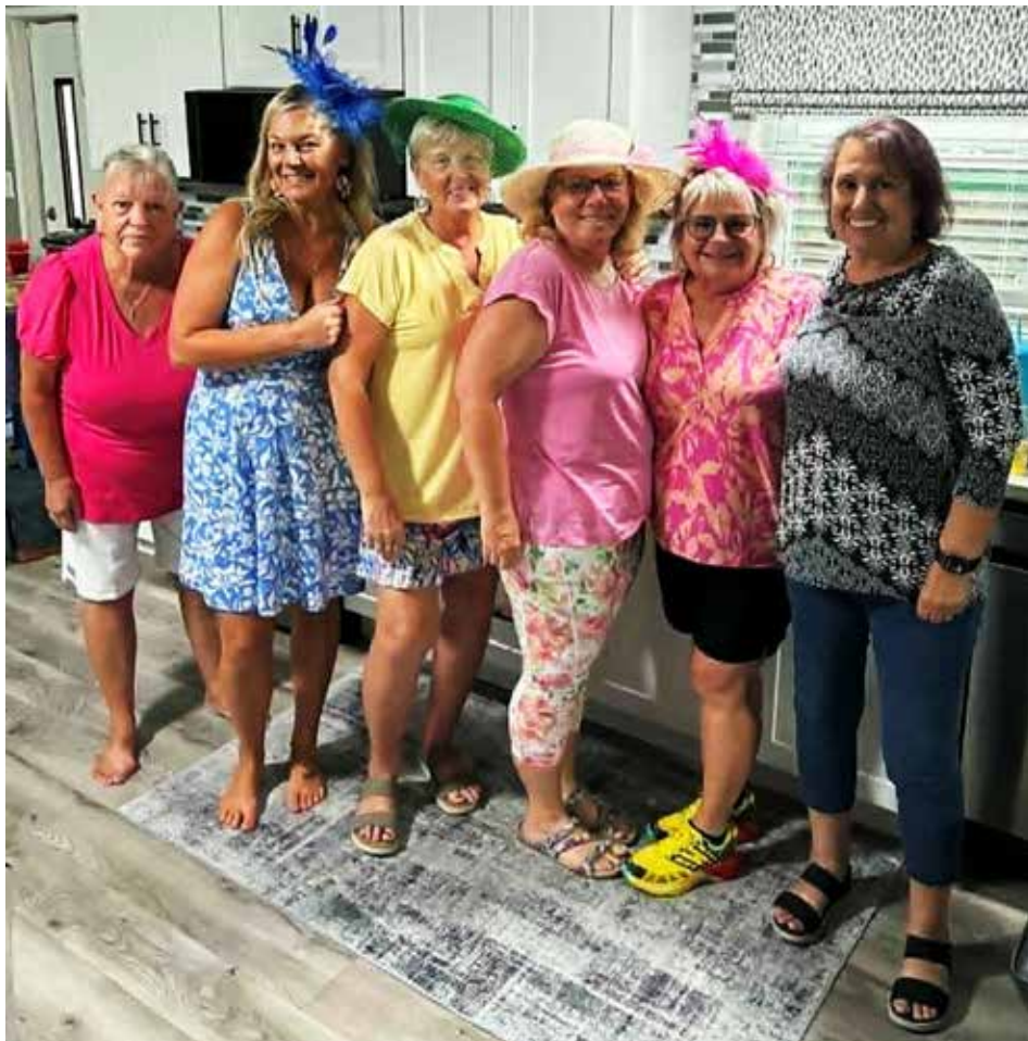
Kentucky Derby Ladies