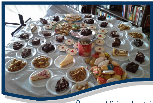
So many delicious deserts!