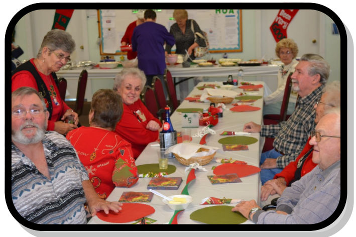
Christmas Dinner 2014