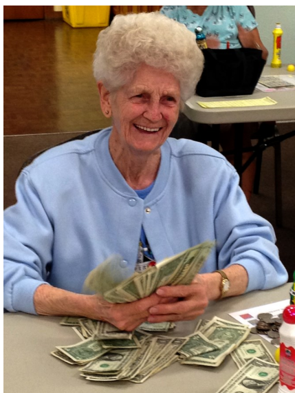
Virginia wins the cookie jar!